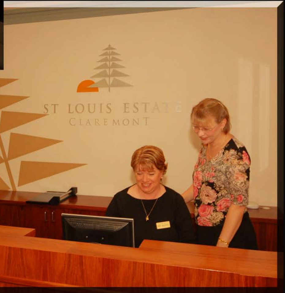
The friendly Reception