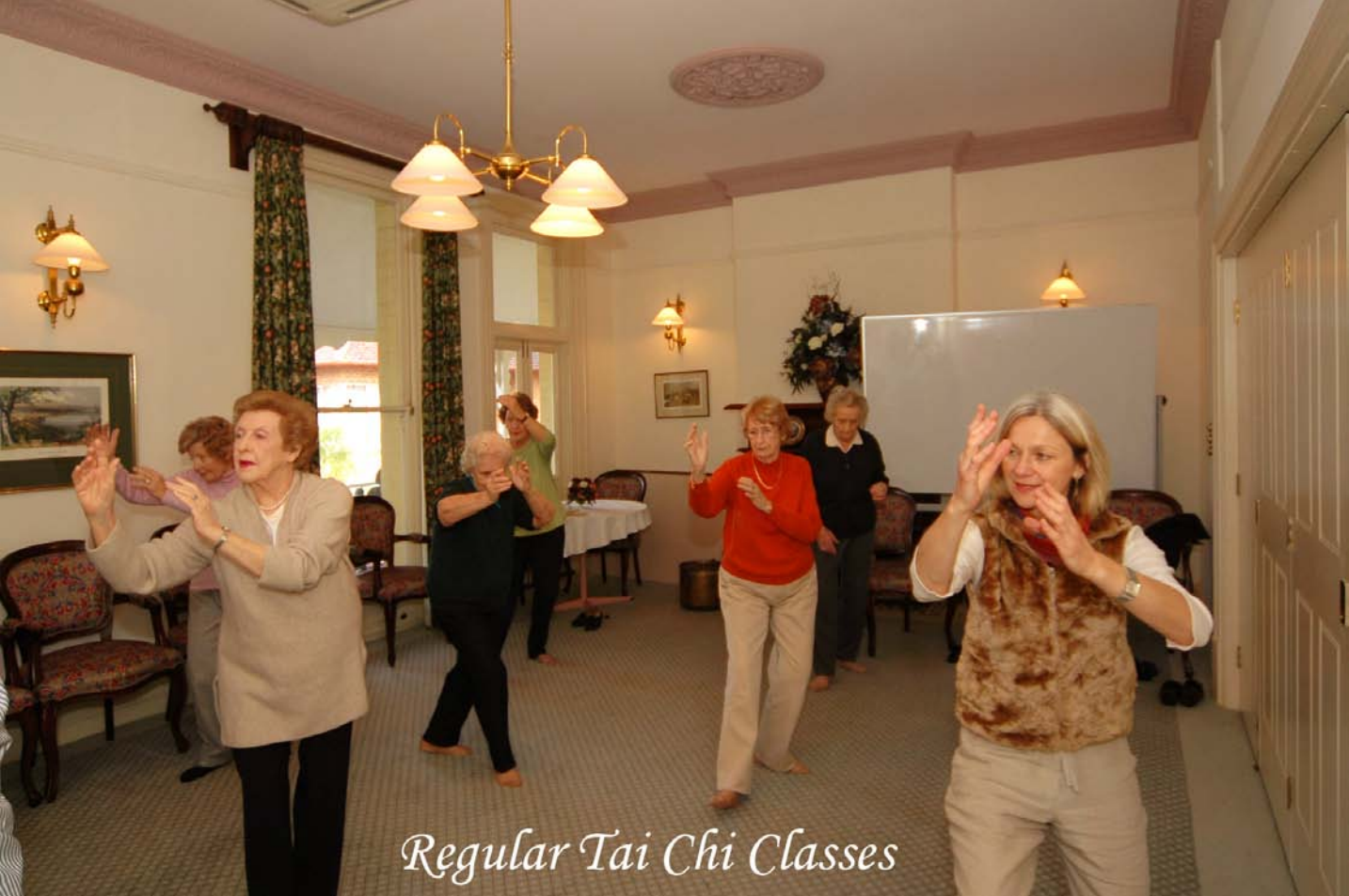
Regular Tai Chi Classes