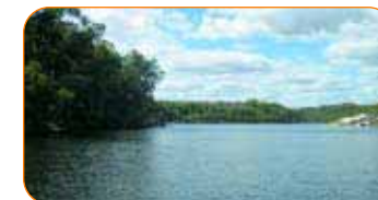
The views from the boat were spectacular.