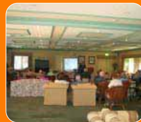
There was a huge amount of interest in this talk.