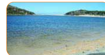
The Moore River's sand bank had not yet been broken, although it was due to any day.