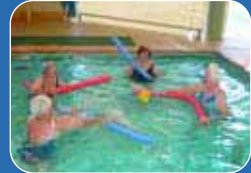
Having fun in the water.

Hydrotherapy is held in the pool on Tuesdays at 9.30am. This is a great no-impact exercise for balance, strength, coordination and great fun.