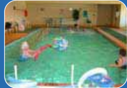
The girls are doing lots of different activities.