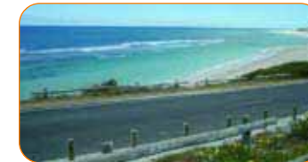
The view from our morning tea stop, at Two Rocks.