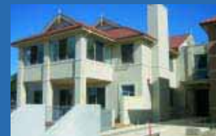
The paving is down in Block 1 & 2