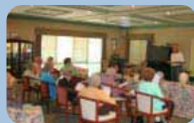
A big group of residents turned up to get advice on how to avoid falls.