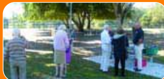
Everyone enjoyed the view at Tomato Lake, our morning tea stop.