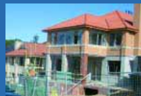
Units nearing completion.

Norfolk and Moreton (Block 1 & 2) are edging ever closer to completion, with the long awaiting occupation due in early June.