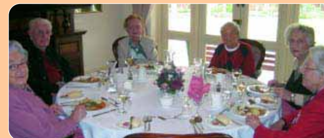
Lunch-goers enjoy a meal together.