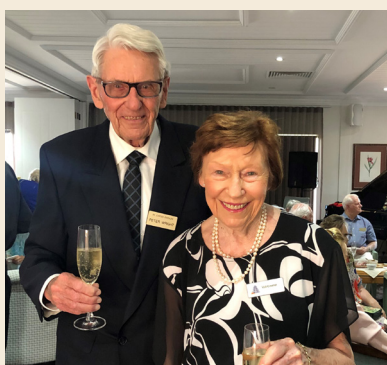
Christmas Cocktail Party