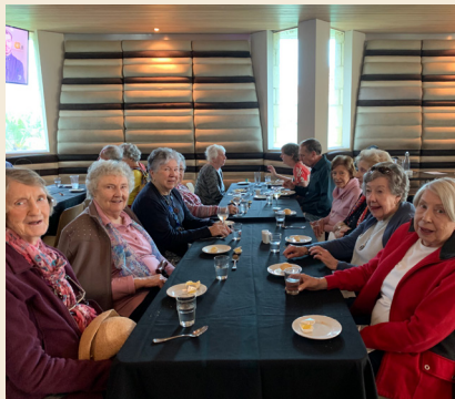
Swan Valley Bus Trip