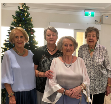
Christmas Cocktail Party