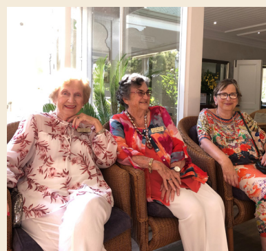
Christmas Cocktail Party