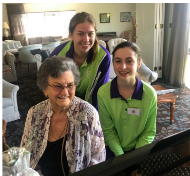
Week of Amazement