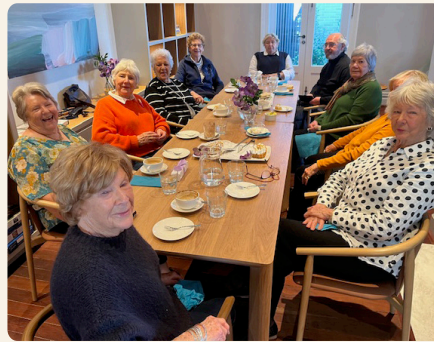
Residents and friends enjoy a tasty morning tea at the long table in Kiora