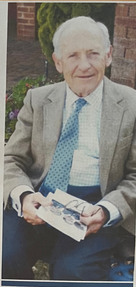
Above: The Right Hon Sir William Heseltine, GCB, GCVO, AC, QSO* near his unit, enjoying the afternoon sunshine.