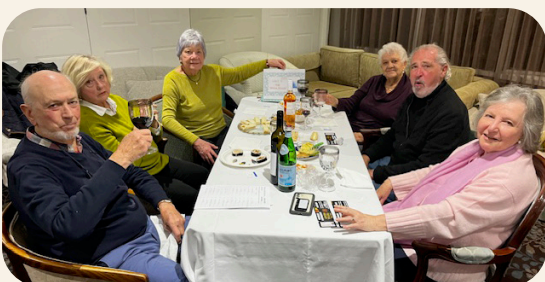
The Trivia Tritons