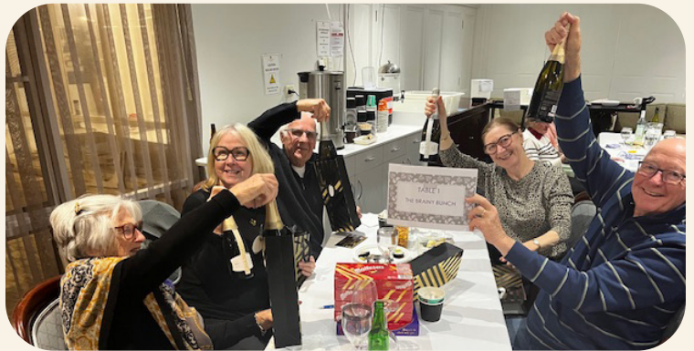
The Brainy Bunch - Our Quiz Champagne Champions!