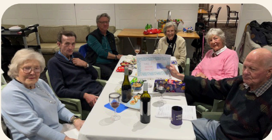
Quizze Rascals - 2 nd place tie-breakers