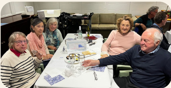
The Quizzards of Oz