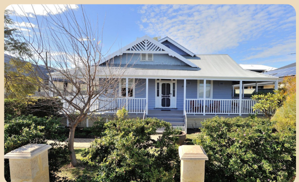
Macedon House, Golden Bay 2025