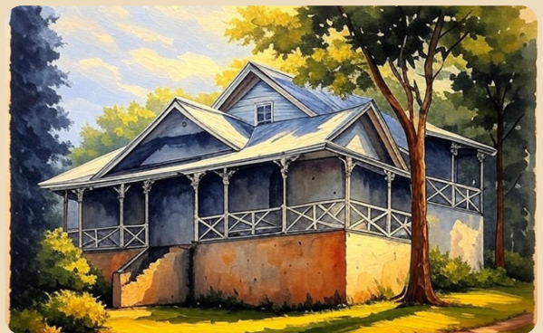
Macedon House St Louis School 1985

So isn't it exciting that within a couple of months the 2 Heritage buildings from the estate will have been brought back to their classical and beautiful states. If you want to see more on Macedon go to Google Maps and search 19 Marlin way, Golden Bay.