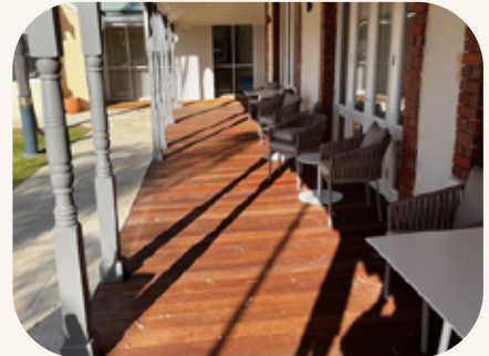
The completed deck rebuild on the north side of the homestead. It has been enhanced by paving slabs flush with the deck opening up the entrance to the building beautifully.