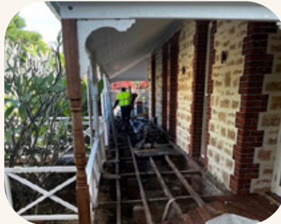
The wooden deck on the south side of the Homestead being removed.

What secrets lie beneath? Old coin, a builders footprint, or a relic of village life long past. Each board removed reminds us that our home is more than a residence it's a living piece of history.