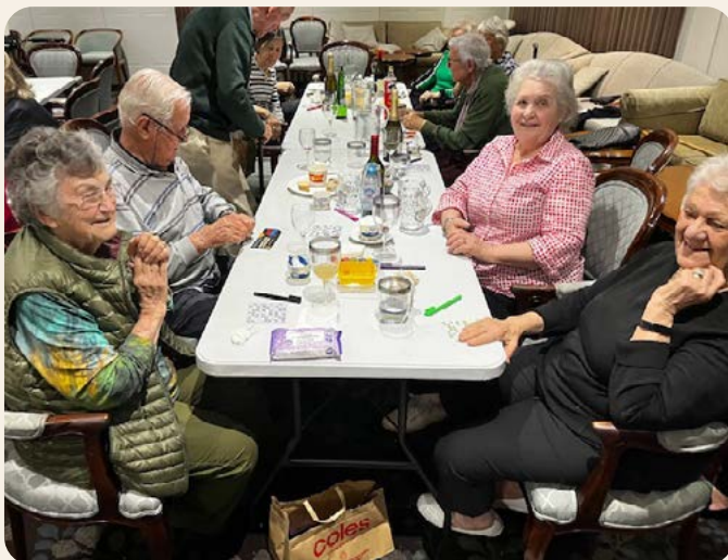
Some of the 40 Residents who enjoyed the night