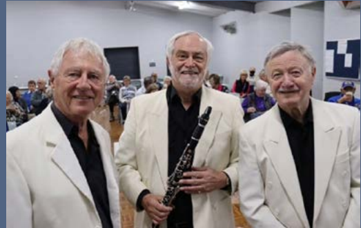
The Melody Masters Trio

BYO drinks and snacks Dress in 50's style (OPTIONAL) Prizes for best outfit and quiz winners