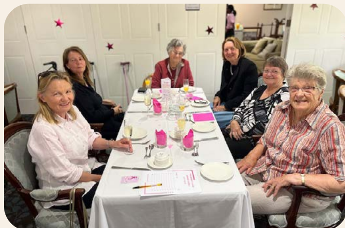
The Winning Table ( with a little help from their family)