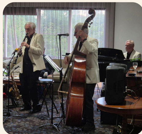
The Melody Makers Jazz band