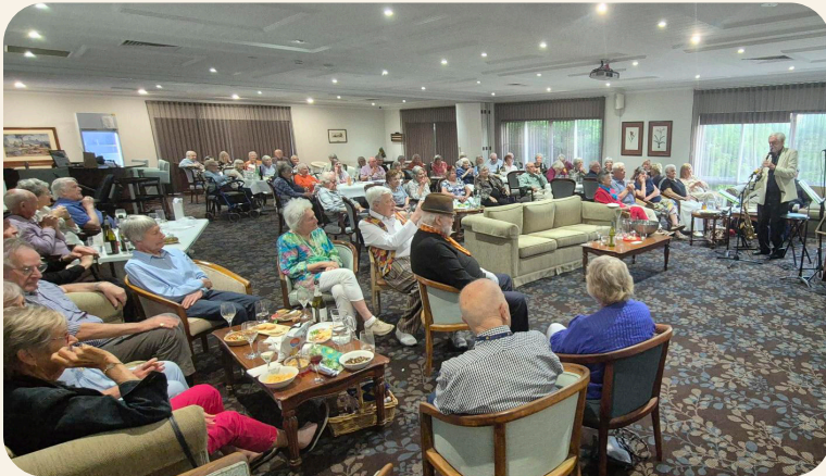
A large audience filled Kingsmill

The band 'The Melody Makers' a polished and energetic trio exceeded all expectations. From timeless standards to lovely upbeat numbers, they played with the kind of talent and enthusiasm that lifted the whole room.