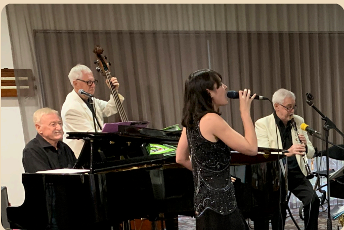
The Melody Masters delivered another excellent Jazz programme.