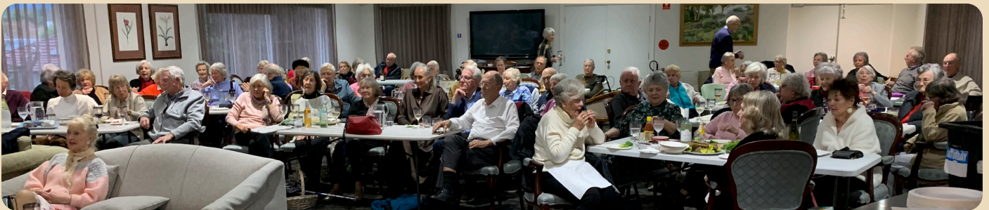
Kingsmill was "Full and Jumping!"