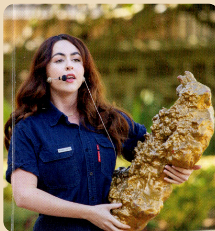
This is a replica of the Normandy Nugget The largest nugget ever found on the Kalgoorlie Goldfields.