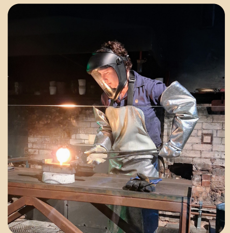
"Like liquid Gold" an expression used for many things. But this is the real thing when we saw gold in molten form transformed into a solid bar. A fascinating process to see.